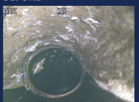
Extreme scale buildup in vacuum line